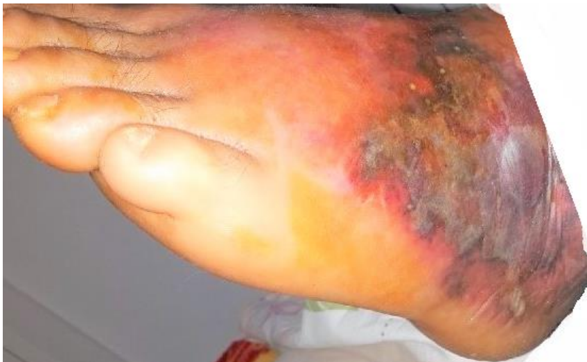
Figure 1: Necrotizing fasciitis