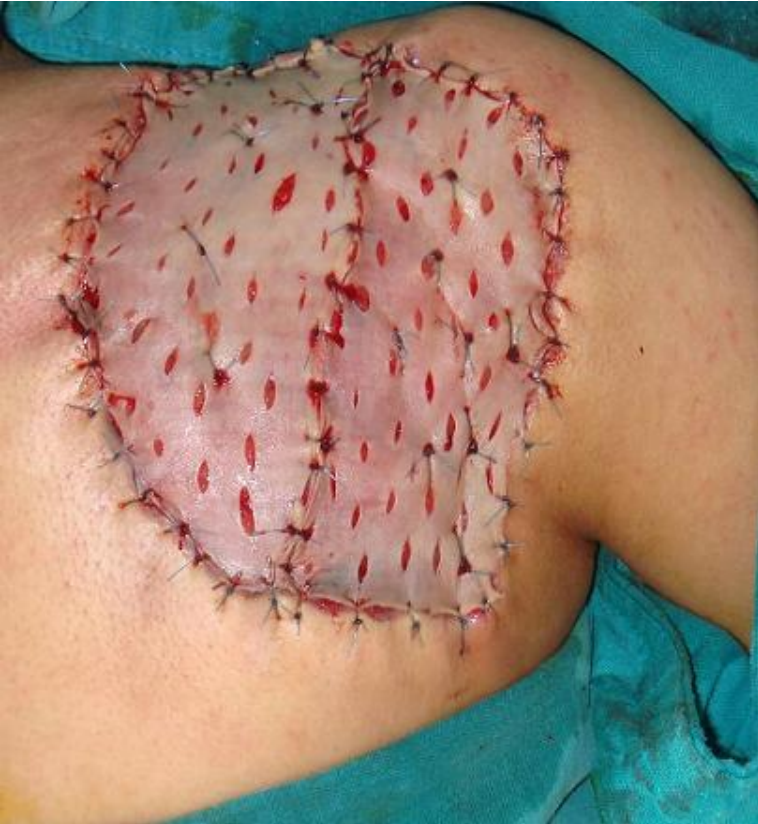
Figure 4: Coverage of the loss of substance by graft of thin skin