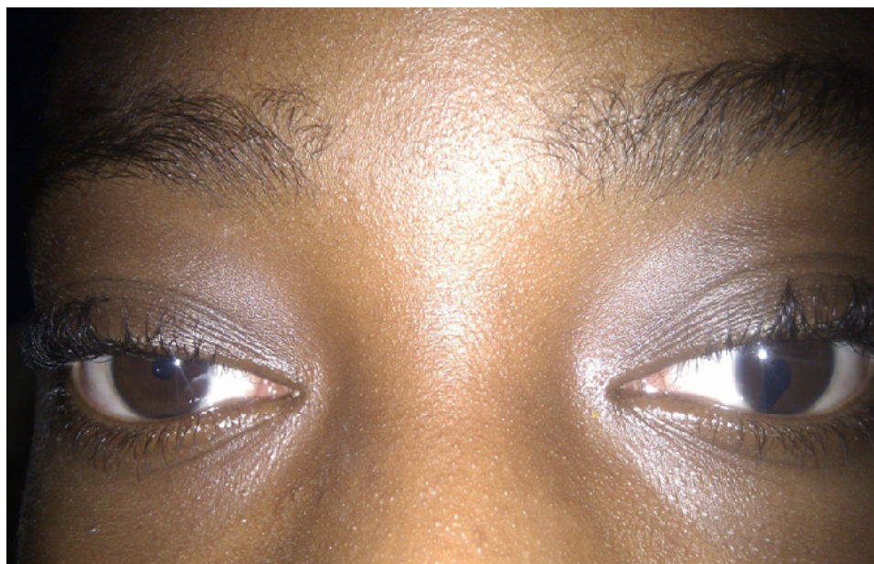
Figure 1: Iris coloboma of the left eye showing the classic keyhole-shaped defect