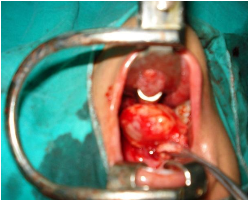
Figure 3: Surgical wound following tumor excision