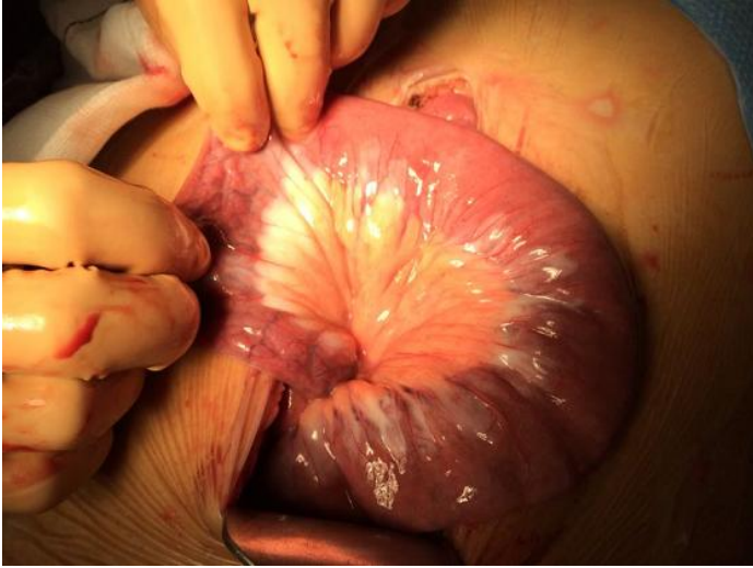
Figure 2: Small bowel recovery with still lymph and venous ecstasy