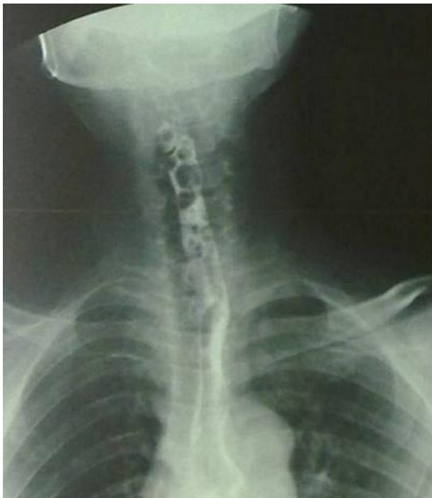
Figure 2: Regression of the pharyngoesophageal diverticulum at barium contrast esophagography