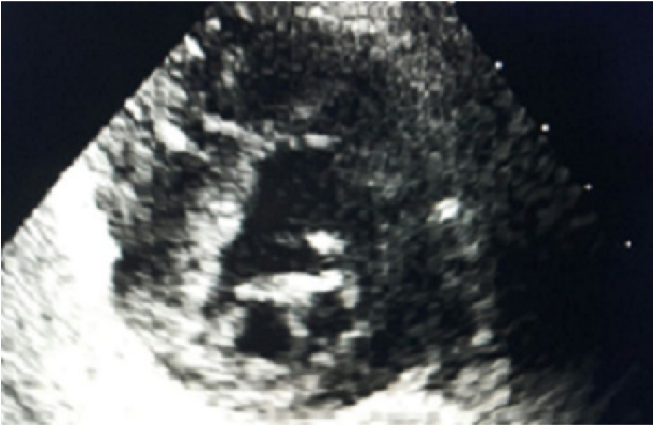
Figure 2: Postoperative echocardiography