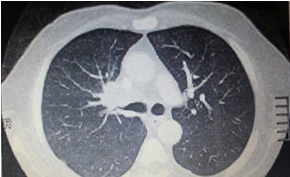
Figure 3: The computary tomography scans of the Chest: a mass in the upper right lobe with mediastinal lymph nodes