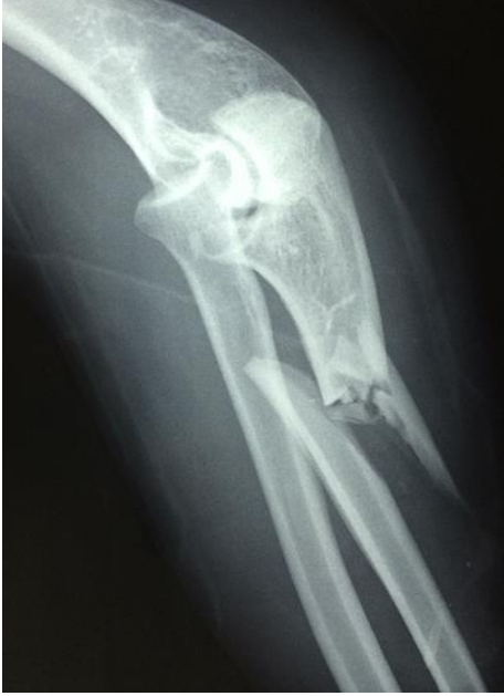
Figure 1: radiography of Monteggia fracture