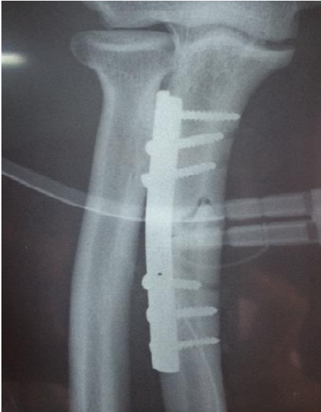
Figure 2: radiography post operative control