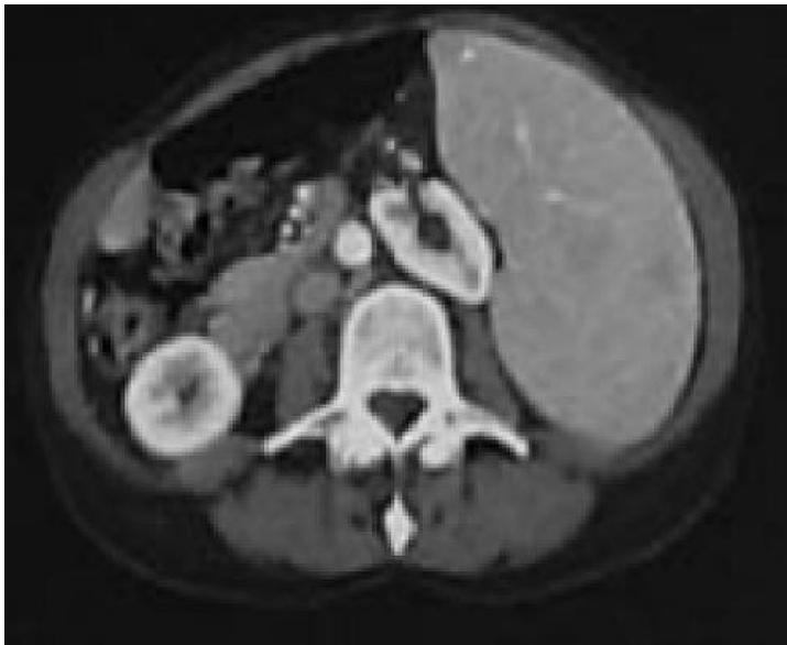
Figure 2: castleman disease: splenomegaly