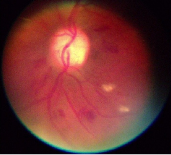
Figure 2: most images were blurred in the periphery