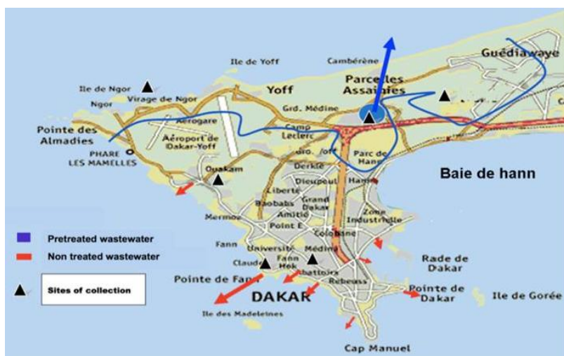
Figure 1 : map of Dakar indicating sampling sites from which the specimens have been collected for environmental surveillance for enteroviruses