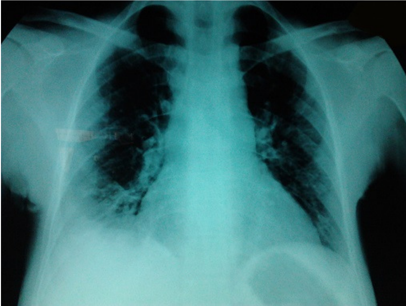
Figure 1: right basal opacity on the chest X ray at diagnosis