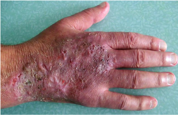
Figure 6: Early desinfiltration and healing in day 7 of treatment with regression of bubbles