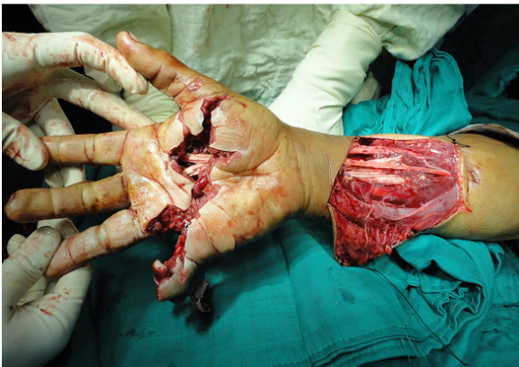
Figure 4: Flexor tendons repair with modified Kessler sutures in musculo-tendinous junction