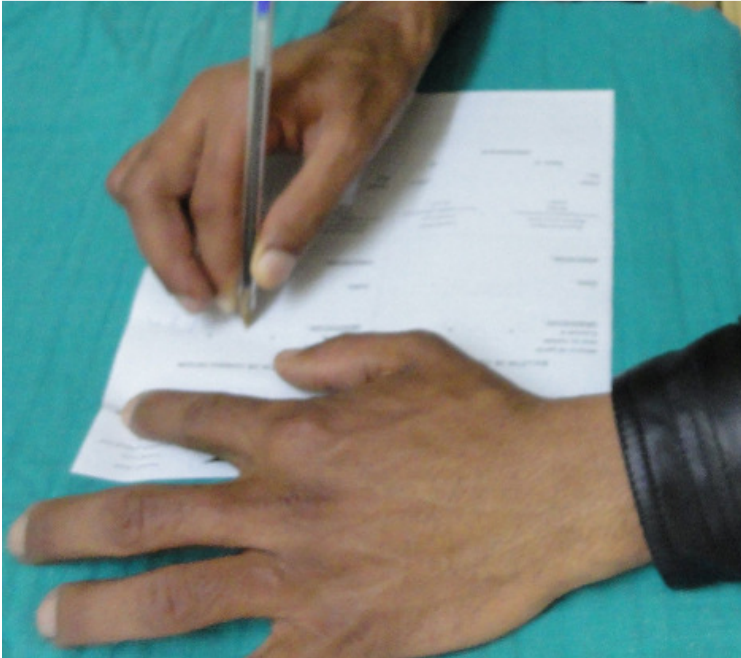
Figure 6: Restoration of functional right hand