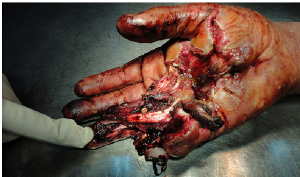
Figure 1: Deep, defiled and circumferential wound interesting Zone III and the ulnar border of the right hand associated to an open distal interphalangeal joint dislocation of the 5th finger