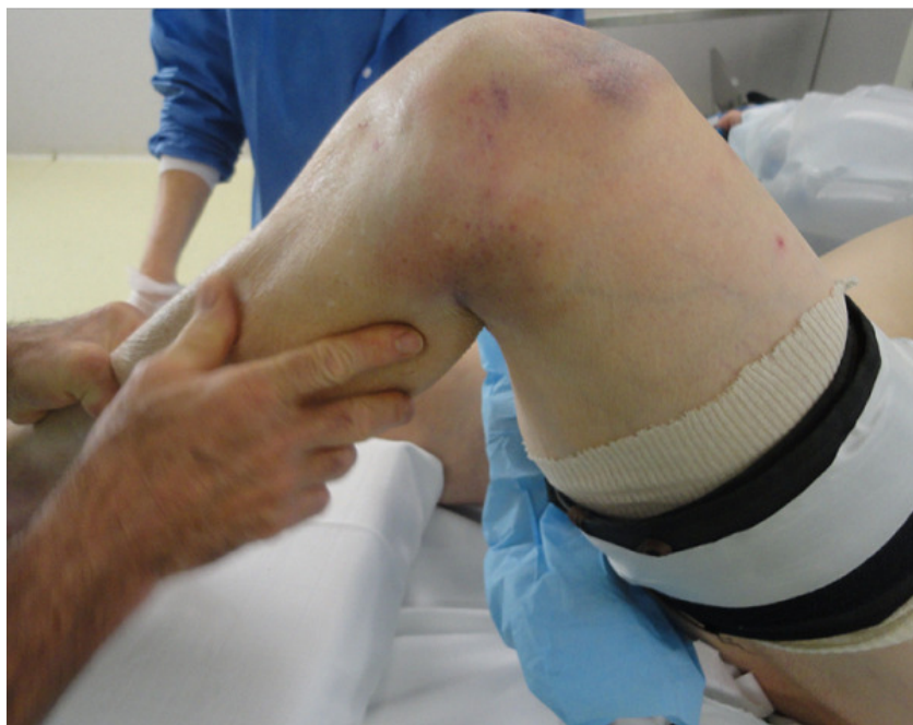
Figure 1: Skin ecchymosis in supra-patellar of the left knee