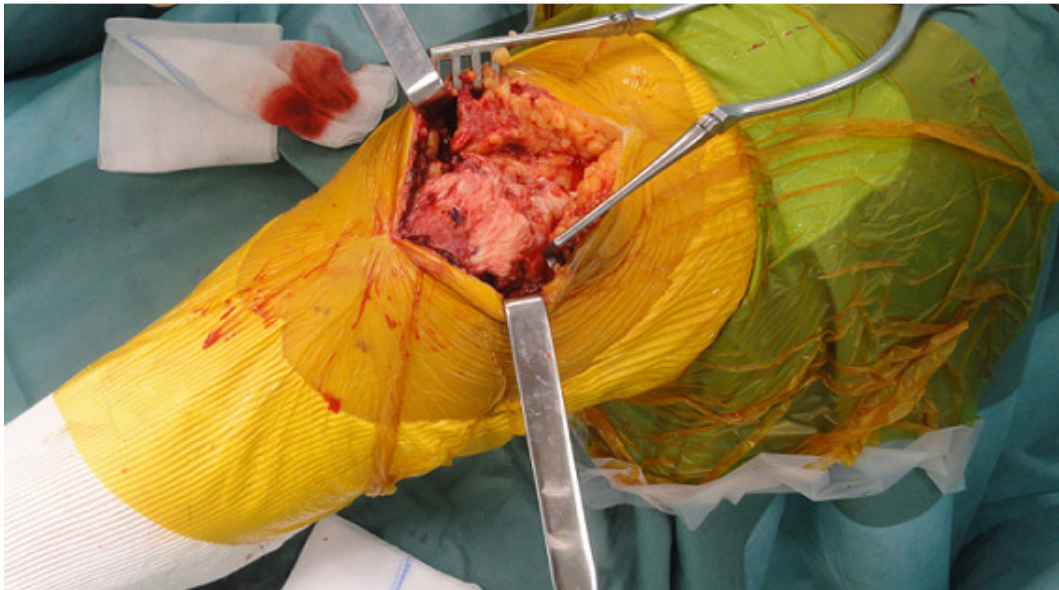
Figure 4: Krackow sutures associated with bone reinforcement of the tendon