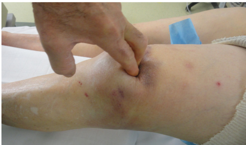
Figure 2: Knee examination showing depression in supra-patellar