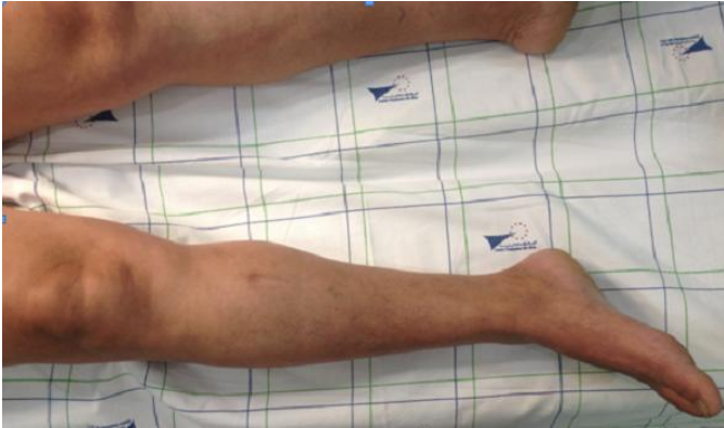
Figure 1: The arrow indicates the swollen area of the right leg