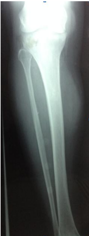
Figure 2: X-ray of the right leg: increased density of soft tissue in the medial aspect of the tibia