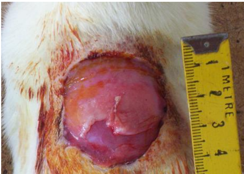
Figure 3: The skin defect in group 2 without suturing