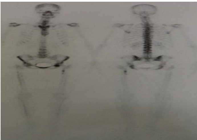
Figure 5: scintigraphy showing hyper fixation of the proximal femur and the sacro iliac joints