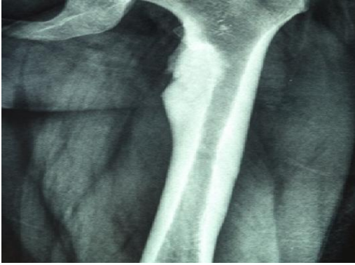
Figure 1: Flowing candle wax condensation in the proximal femur on a plane radiography, specific of the Leri's disease