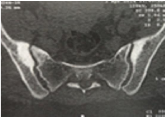
Figure 2: CT scan showing condensation of the iliac sides of sacro iliac joints