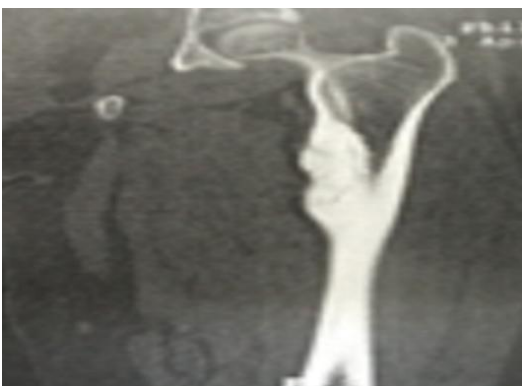
Figure 3: The characteristic candle wax condensation of the proximal femur below the calcar in the CT scan