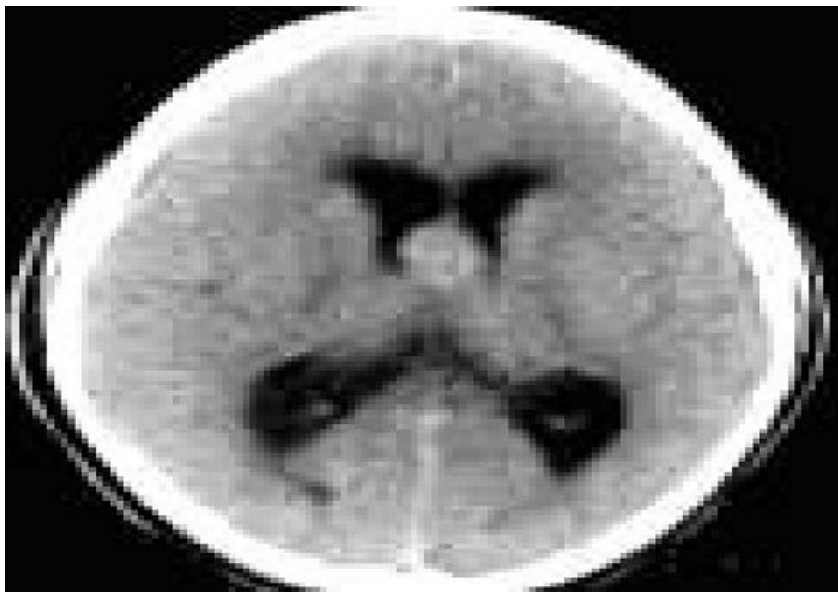
Figure 1: CT scan with an isodense nodular formation in the anterior part of third ventricle