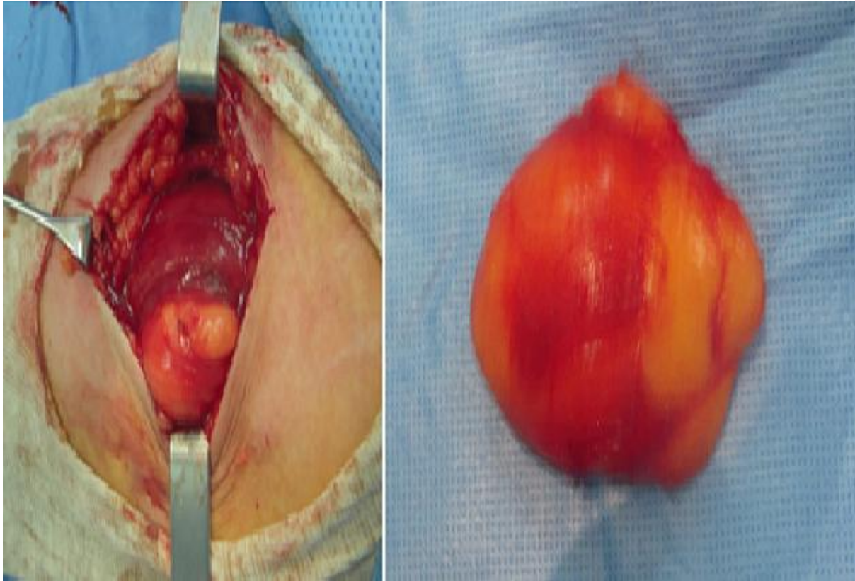
Figure 2: Intraoperative images of the excision. Final pathology revealed a be 8 cm × 6 cm × 4 cm lipoma