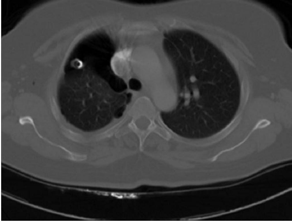
Figure 2: Pneumothorax complicating cavitary lesion