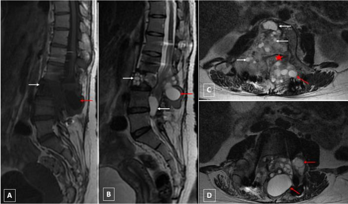
Figure 2: lumbar MRI in sagittal (A,B) and axial sections (C,D) respectively: A (T1WI) and B,C,D (T2WI) showing at L3 level expansible heterogenous lesion with multiple cysts presenting low signal on SE T1 WI (A) and high signal on SE T2 WI (B,C,D), with extension into the spinal canal and compression of the cauda equina (star) and into the peri vertebral soft tissue (red arrow): dumbbell formation according to Braithwaite and Lees classification