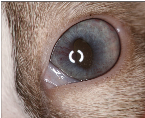
Fig. 1. A 4-month-old female entire Snowshoe kitten with bilateral uveitis. Clinical signs included corneal edema, keratic precipitates, aqueous flare, rubeosis iridis and miosis. The etiology was FIP.

This study aimed to describe cases of feline uveitis focusing on nontraumatic and nonreflex causes. The objectives were to: 1) establish etiology based on recorded clinical findings, diagnostic investigation, and follow-up information and 2) compare cases of idiopathic uveitis to cases with a confirmed etiology (signalment and ophthalmic examination findings). We hypothesized that performing diagnostic testing would increase the likelihood of finding an underlying disease and used a 12-month follow-up period to allow underlying diseases to become apparent.