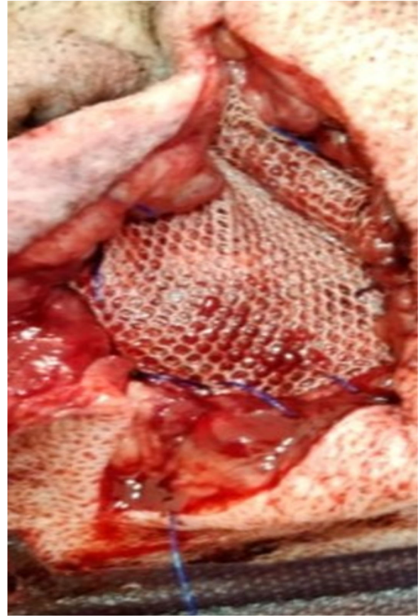
Fig. 4. Mesh implantation in the pelvic diaphragm defect.

In this report, the presented cases were diagnosed as perineal hernias from the history, clinical, and radiographic examinations. All cases were entire adult males and most of them (five cases) had unilateral left-side hernias, while one case had bilateral hernia. The etiology was generally related to urinary and constipation problems. This agreed with previous reports (Burrows and Harvey, 1973; Vnuk et al. , 2008; Williams, 2014). However, many potential factors have been suggested in their development, which include congenital predisposition, hormonal imbalance, prostatic hyperplasia, and docked tails (Bojrab and Toomy, 1981; Bellenger and Canfield, 2003; Niebauer et al. , 2005; Wallace et al. , 2021). The most common signs reported by the owners were perineal swelling,