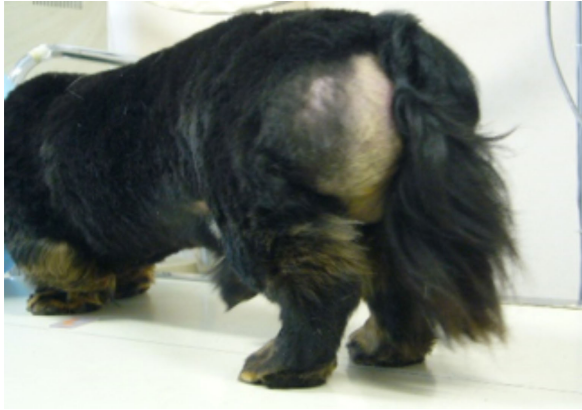
Fig. 2. Unilateral perineal hernia in a Dachshund.