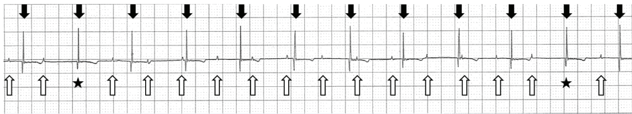
Fig. 1. Lead II trace on the bimonitor during anesthesia. The cat's P waves are marked by upward arrows. The P-P intervals were consistent (0.52 seconds). The P waves that were followed by QRS complexes are indicated by asterisks. The rate of QRS complexes was 75 beats/minute (downward arrows) and their R-R intervals were consistent (0.8 seconds). QRS morphology was normal (duration, 0.04 seconds). Paper speed = 25 mm/second; 1 cm = 1 mV.