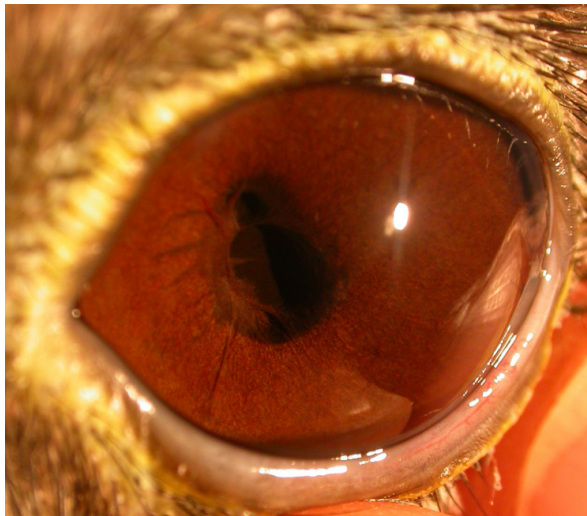
Fig. 4. Posterior synechia presented at 7–5 o'clock OS.

retinoscopy 4 months after surgery. The refraction was -0.50 D OD, whereas OS could not be assessed due to a poor reflection. However, the black kite had a good response when stimulated with moving objects visible from both eyes. The vision of this black kite was judged as substantially improved and adequate for his normal life because the black kite could fly without bumping into any objects and was able to catch all running mice offered. The bird was kept in the Kasetsart University Raptor Rehabilitation Unit since it was tame. Three years after surgery, the bird could still fly without hitting objects and could precisely catch running prey.