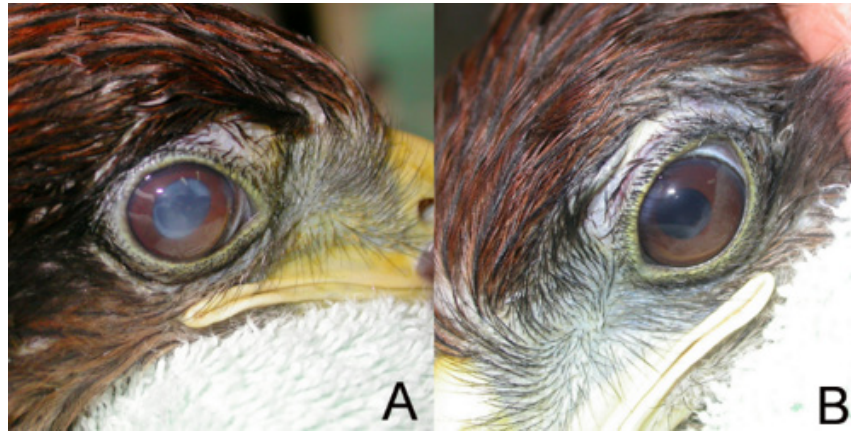
Fig. 3. (A) One week postoperatively, mild corneal edema and posterior capsular opacity were investigated OD. (B) Mild corneal edema was evident OS.