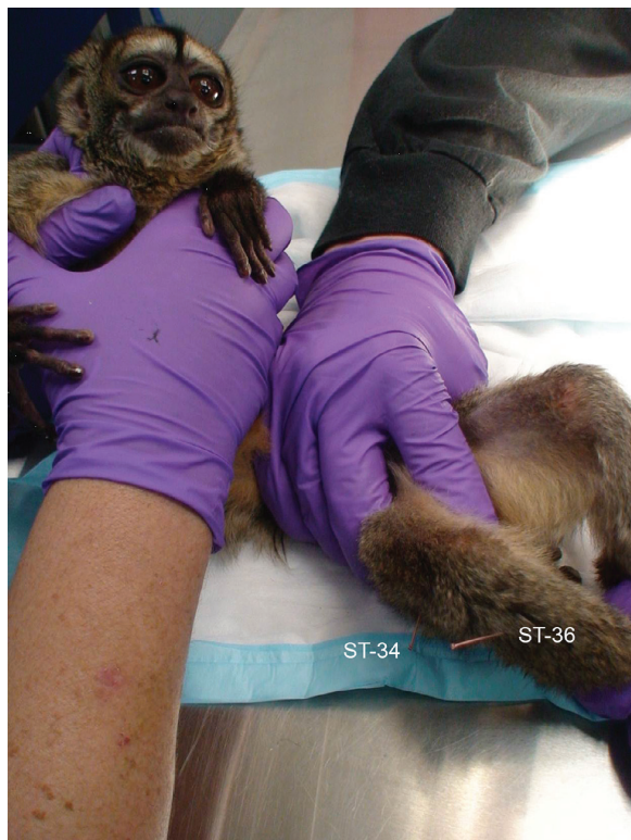
Fig. 2. Acupuncture session for management of knee osteoarthritis in Owl monkey ( Aotus spp ) using ST-34 and ST-36 (Magden, 2017).

and inflammation through stimulation release of neurochemicals and modulators (Han and Terenius, 1982; Zijlstra et al. , 2003). In many species of animals, it is, therefore, an alternative therapy to musculoskeletal disorders (Choi, 2009; Crouch, 2009; Koski, 2011) with no radiographic improvement in the condition but marked clinical improvement and success (Choi et al. , 2016). Some authors have reported several clinical trials indicating that acupuncture benefitted hip dysplastic dogs in relieving the associated excruciating pain (Jaeger et al. , 2006, 2007; Marx et al. , 2014). Choi et al. (2016) concluded that acupuncture is an effective medical intervention for degenerative joint diseases (DJD) in captive raptors based on their experience on management of a raptor once weekly for 2 months using selected acupoints on stomach, bladder, and gall bladder meridians. This was adopted after the failure of allopathic therapy. Acupuncture has been reported to alleviate geriatric conditions, which include general body ache, osteoarthritis (Fig. 2), hind end feebleness, and other long-standing diseases that reduce the extent of sound health (Xie, 2017). In sport medicine, exercise-induced or related impairment, like chronic pain, arthritis, and musculoskeletal injuries, could be managed by acupuncture by increasing blood flow to relieve pain and enhance the health of the affected regions (Xie, 2017).