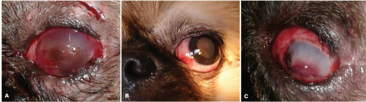
Fig. 3. Images of the eyes of three Pekingese dogs after successful globe replacement surgery and removal of the tarsorrhaphy sutures illustrating (A) keratitis with possible corneal pigmentation; (B) dilated pupil and lateral exotropia; and (C) early signs of atrophied globe with corneal fibrosis, central granulation tissue, and minimal lateral exotropia.