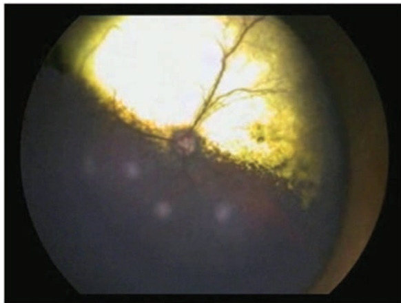
Fig. 5. An endoscopic photograph of the ocular fundus of an 18-month-old Pekingese diagnosed with glaucoma 3 weeks after globe replacement surgery illustrating normal fundus, with normal course and distribution of the retinal blood vessels, and optic nerve cupping.

Pekingese (53.3%) and Griffon (26.7%) being the most affected breeds. This may be inconsistent with previous studies that considered Shih Tzu, Pug, Pekingese, and Boston terrier as mostly affected breeds (Mandell, 2000; Wheler et al. , 2001). Three extraocular muscles were found to be ruptured in approximately 53% of the small-breed dogs admitted to our clinic and associated severe corneal edema was identified in the mixed-breed dog. These cases were expected to have an unfavorable prognosis for vision even after successful GRS. These findings are in agreement with the previously reported results by Gilger et al. (1995) as they considered avulsion of \geq 3 extraocular muscles, lack of vision on initial presentation, and proptosis in nonbrachycephalic dogs are unfavorable indicators for eyes undergoing GRS. Nevertheless, the prognosis may potentially be favorable in nonbrachycephalic dog breeds in certain circumstances because, in the study reported here, the