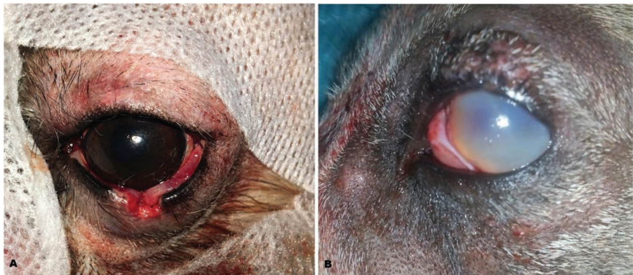
Fig. 2. Images of the eyes of (A) an 18-month-old male Griffon and a (B) 2-year-old mixed breed dog after successful globe replacement surgery. (B) Note the persistence of corneal edema associated with the eye of the mixed breed dog.

OS, optic sinister; OD, optic dexter; DR, dorsal rectus; VR, ventral rectus; MR, medial rectus.