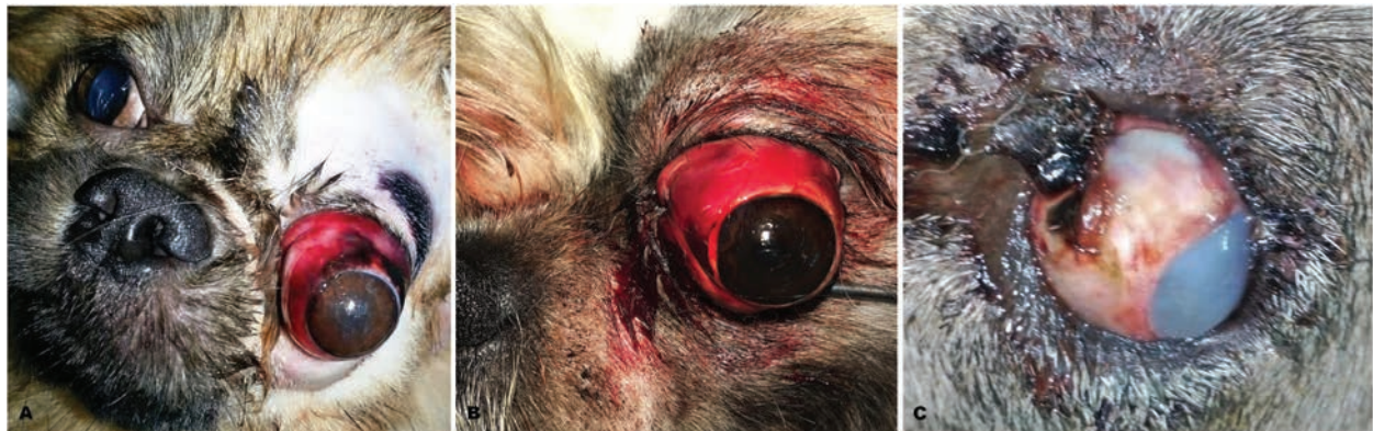
Fig. 1. Images of proptosed eyes in (A) 7-month-old Pekingese, (B) 18-month-old Griffon, and (C) 2-year-old mixed-breed dogs illustrating (A) periorbital swelling and entrapment of the eyelids behind the globe conjunctiva; (A,B) bruised, bloody, and swollen conjunctiva; and (C) corneal edema and marked lateral retraction of the globe. (B) Note the miosis associated with the proptosed eye in the Griffon dog.

Immediate surgical interference was performed in all cases. The globes were successfully replaced within the orbit and the lateral canthotomy sutures were removed 1 week after surgery. Tarsorrhaphy sutures were removed 2 weeks after surgery and the eyes were honorably acceptable to the owners (Fig. 2). Exposure keratitis