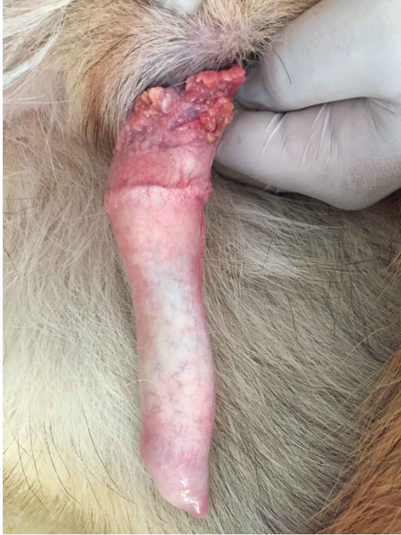
Fig. 2. Male external genitalia infected with CTVT (Case 3).

On treatment with Vincristine, all three dogs showed complete regression of the tumor mass. No tumor recurrence was noted. The female dogs showed complete regression after 4 wk of treatment, while the male dog