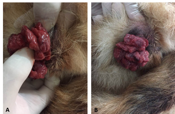
Fig. 1. (A) Female external genitalia infected with CTVT (Case 1). (B) Female external genitalia infected with CTVT (Case 2).

The growths were quite friable and bleed easily on manipulation. The diagnosis was strongly based on the clinical examination and confirmed by examination of hematoxylin- and eosin-stained sections of the masses. Microscopic examination revealed sheets of malignant cells infiltration. The malignant cells were large in size with large hyperchromatic pleomorphic nuclei and prominent nuclei with frequent mitosis, surrounded by dermoplastic stroma. The presence of identical large, vacuolated tumor cells (Fig. 3) confirmed the diagnosis. The three cases were treated with intravenous injections of Vincristine at the rate dose of 0.025 mg/kg once a week for 1 mo. The drug was diluted in 250 ml of