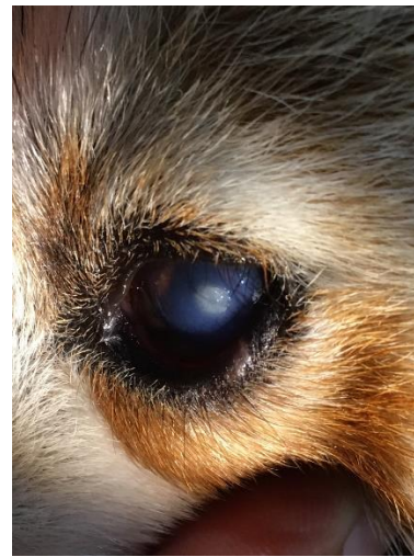
Fig. 3. Epithelial plaque and stromal abscessation in the left eye of a female red panda (case 2).

Cytology results were inconclusive and culture was negative. Histopathology results were diagnostic of ulcerative fungal keratitis with an abundance of filamentous, branching fungal hyphae (Fig. 4). The fungi were not typical in appearance of Aspergillus spp.