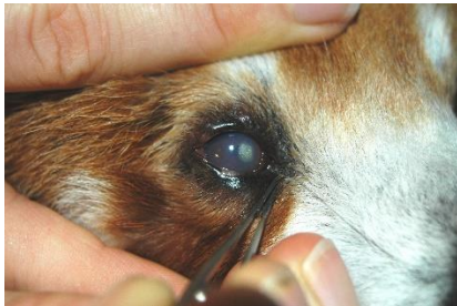
Fig. 1. Epithelial plaque and stromal abscessation in the right eye of a male red panda (case 1).