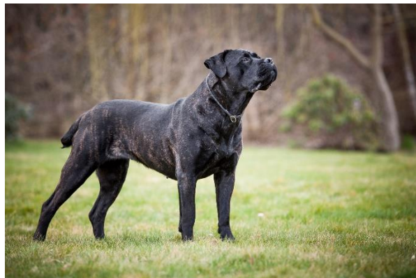
Fig. 1. Photograph of a Cane Corso Italiano dog.

We obtained data on 232 deceased dogs from 73 kennels and individual owners from 25 countries (Australia, Belgium, Bosnia and Herzegovina, Bulgaria, Canada, Czech Republic, Estonia, France, Germany, Greece, Hungary, Israel, Italy, Latvia, Macedonia, Montenegro, Netherlands, Poland, Russia, Serbia, Slovenia, Spain, Turkey, Ukraine, USA).