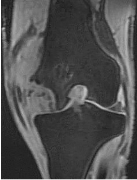
Fig. 4. Dorsal Coronal T1 FAME (fast acquisition with multiphase elliptical fast gradient echo) magnetic resonance image performed post mortem illustrating fracture of the left medial femoral condyle and soft tissue disruption of the medial aspect of the medial femorotibial joint.

The abaxial aspect of the MFC was absent with an irregular margin to the remaining axial aspect. In all sequences, regional hyperintensity was noted throughout the remaining MFC extending proximally into a large portion of the distal femoral metaphysis.