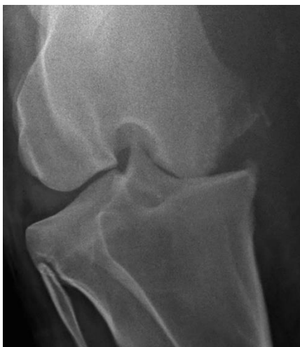
Fig. 2. Caudocranial radiograph of the left stifle performed 14 days post-operatively revealing joint collapse and fracture of the medial aspect of the distal medial femoral condyle.

Ultrasound examination included markedly thickened soft tissues of the left medial aspect of the stifle with numerous distally shadowing mineral foci within thickened soft tissues. The medial meniscus was not visible within the stifle joint. Marked irregularity of the articular surface of the MFC was noted and the medial collateral ligament (MCL) was moderately irregular. Given the degree of damage to the MFT joint and the degree of discomfort displayed by the patient, the owners opted for humane euthanasia.