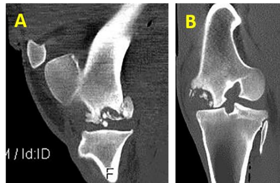
Fig. 3. (A): Sagittal computed tomography image performed post mortem showing fracture of the left medial femoral condyle with multiple pieces of subchondral bone within the medial femorotibial joint capsule. (B): Dorsal computed tomography image performed post mortem showing fracture of the abaxial aspect of the left medial femoral condyle with multiple fragments.

Additional diagnostics including computed tomography (CT), magnetic resonance imaging (MRI) and both gross and histopathology were performed to better evaluate and characterize the stifle lesion. CT of the left stifle was performed using a GE Lightspeed, 4 slice helical CT scanner (Fig. 3a and 3b).