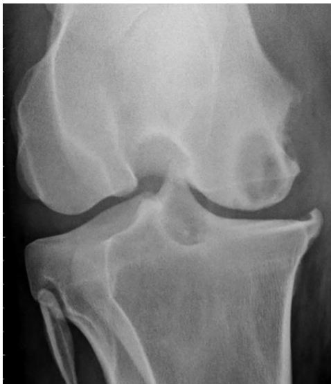
Fig. 1. Caudocranial radiograph performed on initial presentation, revealed a large subchondral bone cyst (SBC) in the left medial femoral condyle (MFC) with secondary osteoarthritis. Enthesiopathy of the distal medial femur and proximal medial tibia.

A radiographic series (lateromedial, caudocranial and caudolateral craniomedial oblique) of both the left and right stifles were obtained using a CPI Millennia Telescoping (3 Phase) radiograph unit with a Sound-Eklin Mark III digital component. Radiographic findings of the left stifle (Fig. 1) included an approximately 3.1cm x 2.1cm x 2.3cm in diameter ovoid lucency with surrounding sclerosis noted within the MFC at the articular surface, several subtle smaller rounded lucencies adjacent to the large ovoid lucency measuring approximately 0.4cm and 0.3cm each, a large smoothly margined osteophyte present at the proximal medial tibia and significant increase in soft tissue opacity present within the medial femorotibial joint.