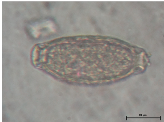
Fig. 2. Urine sediment examination. Pearsonema plica mature egg, showing a thick wall and bipolar plugs (Bar = 20 µm).

with non-steroidal anti-inflammatory drugs. Six months after the initial examination, the dog was presented for a routine health control and the resulting urine sediment examination was negative for P. plica .