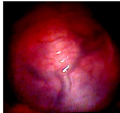
Fig.3 Uterus at late stage of pregnancy

The gravid uterus was located close to the urinary bladder in early pregnancy and in abdominal cavity in the mid and late stages of pregnancy. Laparoscopic procedure for various surgical interventions during pregnancy has been considered effective and safer in human females (Hunter et al. , 1995; Reedy et al. , 1998). In the present report, all the animals recovered smoothly and started eating and drinking.