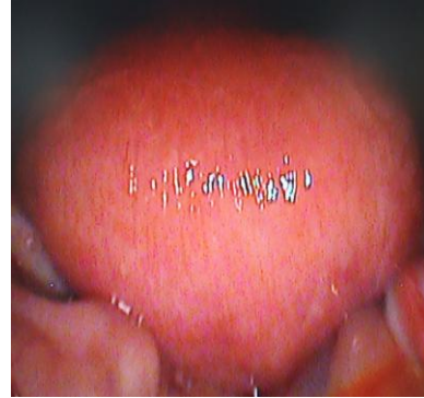
Fig. 2 Uterus at mid stage of pregnancy

In mid stage of pregnancy the uterus was relatively larger in size and appeared as a ball (Figure 2). In the late stage of pregnancy, the uterus was visualized like 'shot put' ball (Figure 3).