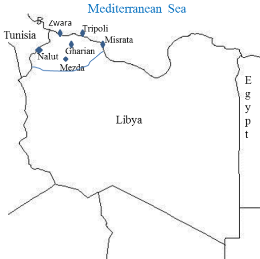
Fig. 1. Geographical map showed the studied area (northwestern part of Libya).

The identification of captured animals was done according to Dorst and Dondelot (1990). Carcasses were preserved in 10% formalin in special jars and transported immediately to the laboratory.