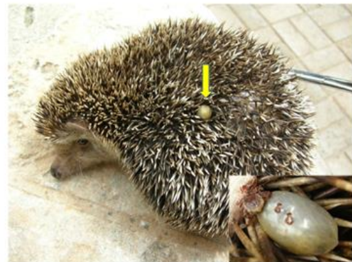
Fig. 3. Hedgehog ( E. algirus ) infested with ticks (Male and female).