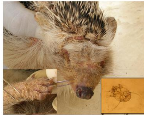
Fig. 2. Hedgehog ( E. algirus ) with mange ( S. scabiei ) on face and leg.

Seventy hedgehogs were sampled in total, 39 (55.7%) of which were found to be infested with ectoparasites (Table 1). Four species were identified, one mite ( Sarcoptes scabiei ) (Fig. 2), one tick ( Rhipicephalus appendiculatus ) (Fig. 3) and two fleas species ( Xenopsylla cheopis and Ctenocephalides canis ). A total of 44 ticks and 491 fleas were collected from infested hedgehogs. The prevalence of S. scabiei , Rh. appendiculatus and the two species of fleas were 10 (25.6%), 8 (20.5%) and 11 (28.2%) respectively. The prevalence of mixed infestation with S. scabiei and C. canis was 3 (7.7%), Rh. appendiculatus and C. canis was 2 (5.1%), and infestation by two species of fleas was 5 (12.8%).