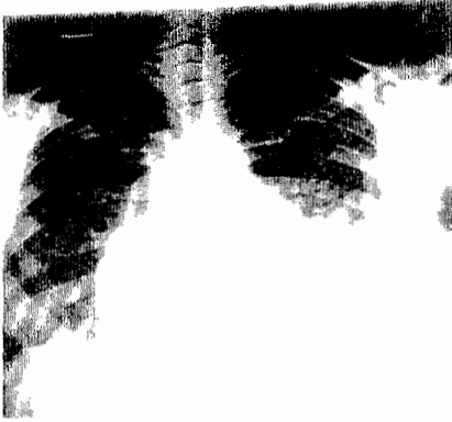
Fig. 3: Repeat CXR of patient in figure 1 post operatively showing enlarged cardiac silhouette.

responded well to pericardiectomy. Two out of every three (66.7%) had good response subjectively after 4 months; 5 (23.8%) had poor response while 2 (9.5%) had borderline response.