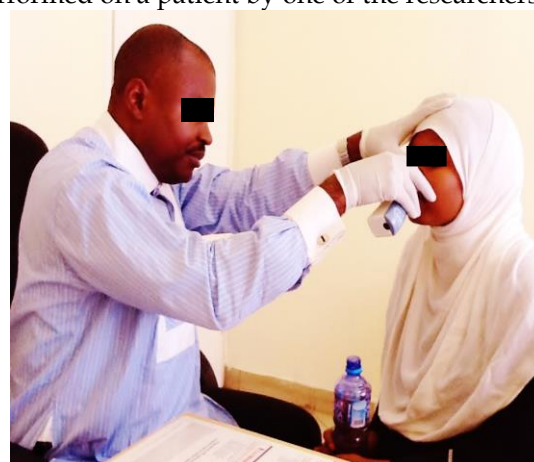
Figure 2. The EarPopper procedure being performed on a patient by one of the researchers

Data were analysed using Statistical Package for Social Sciences (SPSS) version 21 software.