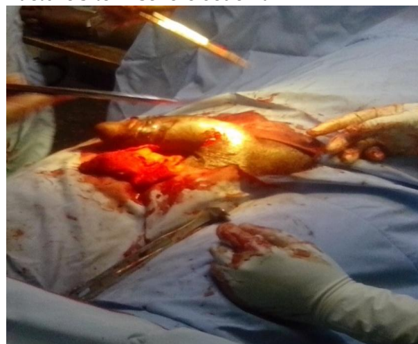
Figure3. Additional incision over the fracture site in severe oedema