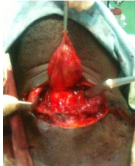
Figure 4. Thyroglossal duct cyst excised (Sistrunk's operation)

In patients with TGDC who refuse surgery, the alternative procedure to surgical treatment is percutaneous ethanol injection. 14,15 Our patients were followed-up for 18 and 24 months, respectively, with no recurrence.