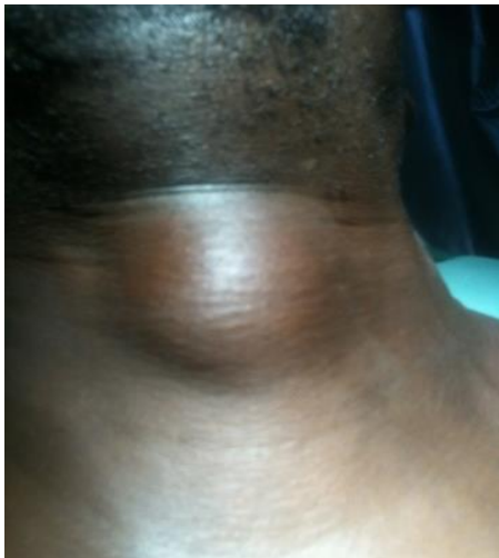
Figure 1. Anterior neck swelling in an adult, thyroglossal duct cyst

Thyroglossal duct cysts uncommonly stay for a long time and might undergo metaplastic change. Malignant transformation does occur in the adult TGDC but are rare, being seen in <1% of cases. Ewing, et al. studied 47 patients with tissue diagnosis of TGDC and reported malignant degeneration in 2 patients above the age of 20 years. 6 The most frequently reported malignancy is the papillary thyroid carcinoma. 6 Documented reports show a sex variation with male to female ratio of 3.1:1, in the study reported by Ahmed. 8