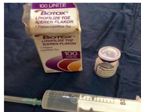
Figure 1. Botox ® injection

Pre-procedure investigations reported packed cell volume as 35%, normal urinalysis, normal