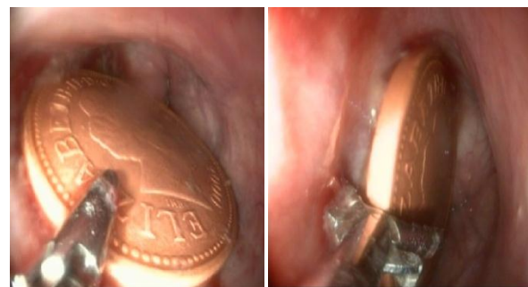
Figure 2. Flexible endoscopic retrieval of two pence coin

The patient was discharged home three hours after the procedure in a stable condition. On his follow-up visit on the 1 st post-procedure day, there was a sore-throat which had resolved by the day-7 visit. There was no further complaint and parents were relieved of anxiety.