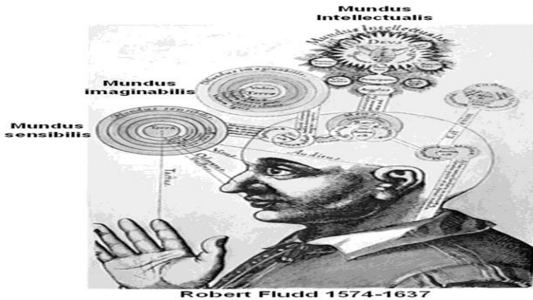
Figure 2: source- Agnati, et al (2013)

Until this bridge is built, the word of God cannot be effectively communicated in such a way that the people hearing the Word understand who they are and who others are. Communicating the Gospel without building a bridge would rather take people away from themselves, thus, creating a problem of identity. The major task of the gospel message, which is the transformation of a people's worldview and their conceptual system would not be adequately achieved. Igwebuike theology of Ikwa Ogwe , therefore, emphasizes identifying with the people and communicating the message through the press of the people or the media of the people, using the language imbued in the people's 'mundus sensibilis' (perceived world) which is indicative of their 'locus intellectus' (context for understanding), and putting into consideration the people's pastoral geography and social physics as the Incarnate Christ did. The act of building a bridge between both religious cultures is to ensure that the gospel becomes culture and the culture becomes gospel- thus, the gospel message becomes culturally situated, and tongue dependent.