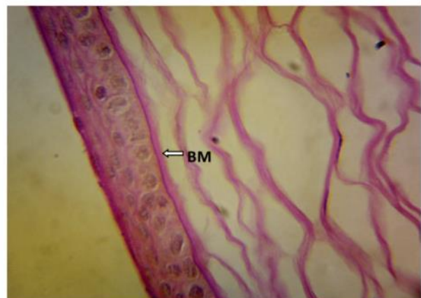
Fig. 2: Photomicrograph of the Cornea showing the PAS positive Bowman's membrane BM. Note the PAS positive reaction of the corneal epithelium. X1000 PAS (counterstained with Harris haematoxylin)