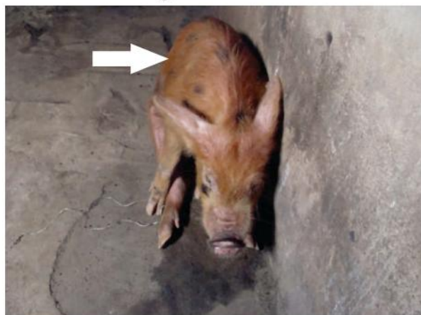
Figure 2: Pig in dog-sitting position with arched back

Tetanus diagnosis was made by observing the clinical presentations in combination with history of recent injury to the skin (Blood et al., 1983). Full-blown tetanus can seldom be confused with other diseases because of its distinct clinical signs. Other