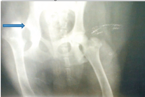
Plate 2: Antero-posterior radiograph of the hip of a six-month-old Caucasian with antero-dorsal luxation of the right femur