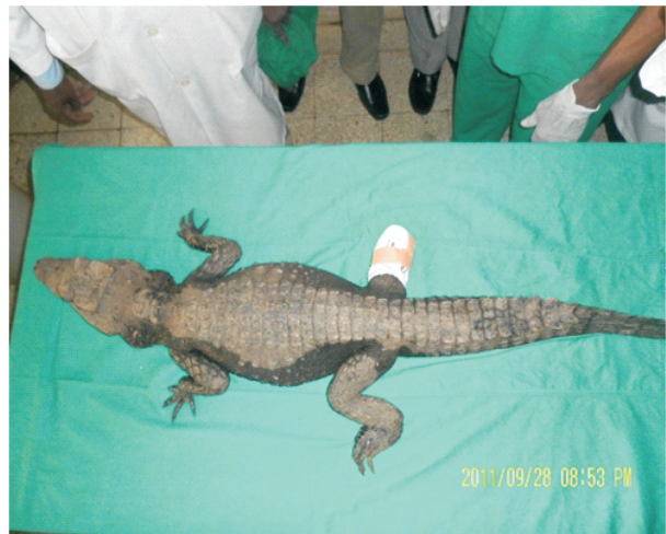
Plate 4: showing crocodile after surgery.