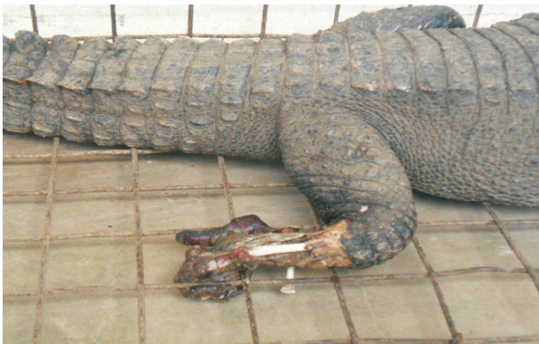
Plate 1: showing the extent and severity of limb injury.

importance globally and veterinarians are often called to attend to such conditions. Unfortunately, the basic anatomy, physiology, medicine and surgery of these species are not emphasized at the Doctor of Veterinary Medicine (DVM) level. Consultancies by the veterinarian do not only end with treatment of disease but also extends to other aspects of wild life management such as housing, breeding and nutrition. Wild life management is a multidisciplinary branch of science and several advancement has taken place in this area in recent years. Veterinary students should be familiarized with the basics of wild life management, medicine and surgery as a means of meeting the global challenge of wild life conservation.