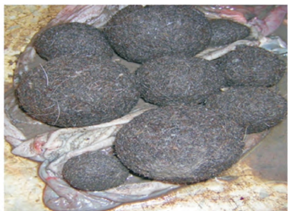
Figure 2. Nine hair balls (2-6cm in diameter) in situ immediately after incising the rumen