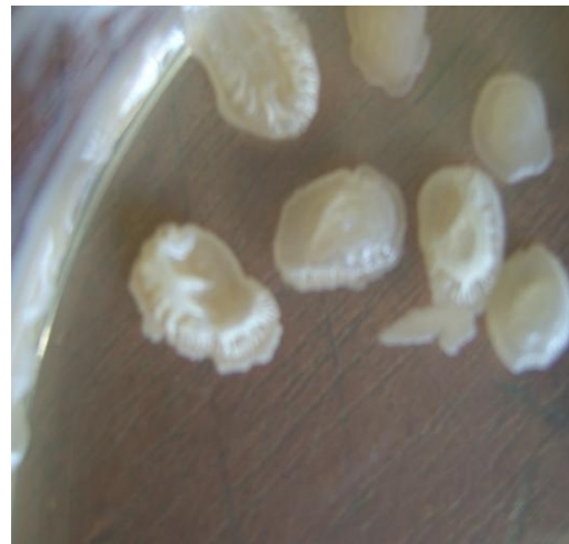
FIGURE 2. Colonies of Actinomyces viscosus on nutrient agar. 72h incubation at 37°C (x6)