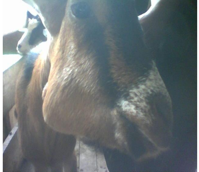
FIGURE 1. The WAD goat at the time of presentation

White rough colonies of about 2-3 mm in diameter (Figure 2) were observed after 48 hours incubation. The colonies adhered to the medium. Stained smears of the colonies revealed Gram positive, diphtheroidal rods with slightly branched filaments and some showing beaded appearance (Figure 3) which were ZN negative (non acid fast). The biochemical characteristics of the isolate are presented in Table I. The sensitivity or resistance of the isolate to the tested antimicrobials (Table II) was based on reference zonal diameter interpretative standards (Anonymous, 2005). Healing was complete within 10 days post intervention.